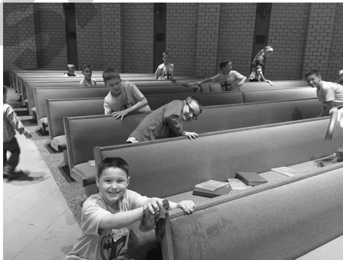
(Conquest Omaha cleaning their parish for Holy Week)