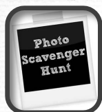
Photo Action Scavenger Hunt - Are the boys ready for an adventure? photo scavenger hunt is like a regular scavenger hunt except it involves action by doing things and taking pictures for proof. This will get boys doing things way outside their comfort zone.