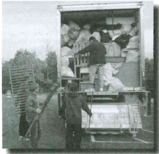
It was a challenge to fit all the donated goods into every available space of the 26-ft truck.

Located near Natural Bridge State Park, The Catholic Church of the Good Shepherd in Campton, Kentucky is a small parish within the Diocese of Lexington, with just 35 registered parish families on record. Nonetheless, the church serves as a beacon of hope for low-income families throughout the area. Over the course of several weeks this fall, the St. Pius X Boys Conquest Club asked for donations of household items, furniture, and clothing to help Good Shepherd in its mission to provide for the needy. In typical St. Pius fashion, parishioners answered the